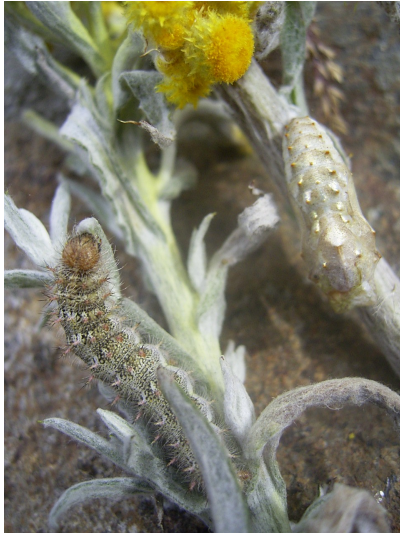
Caterpillar and chrysalis of Painted Lady, on one of their favourite foodplants, Chrysocephalum semipapposum , in my garden.

Butterflies have recently been found to be useful indicators of the success of revegetation programs. Hopefully they will show the success of yours! A copy of the Butterflies of Tasmania book can help you to start identifying them.